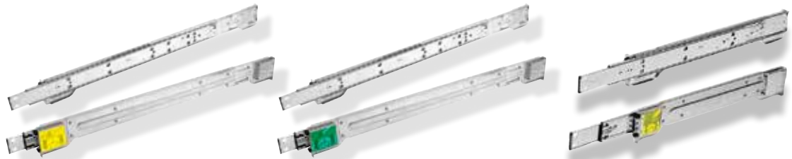
For Short-depth Chassis Rack