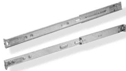
For Short-depth Chassis Rack